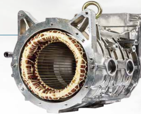
Housing Starter Assembly

The DCT Actuator rapidly moves the doubly clutch, making for a quick and smooth gear shift. It reduces fuel consumption and enhances driving performance. SNT Motiv supplies DCT actuator that has been adapted for next generation transmissions such as 6 speed and 7 speed.