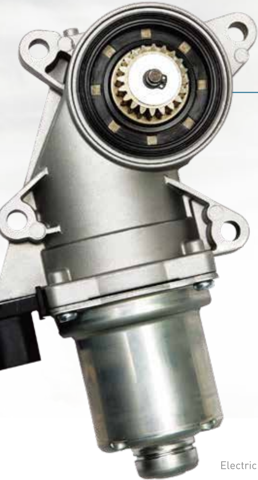
Electric Shift Motor