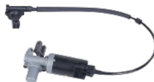
Gear Train Pedal Motor