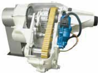
Transfer Case Module

SNT Motiv has developed and grown into a global motor maker by leading the world motor market through thirty years of technical innovation and creativity.